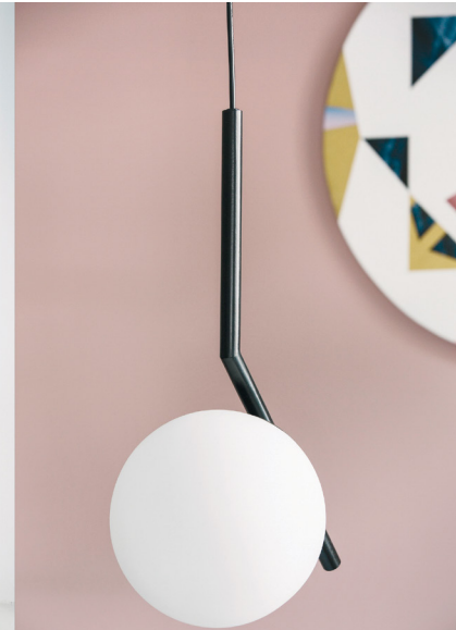
STAY EVIL KIDS