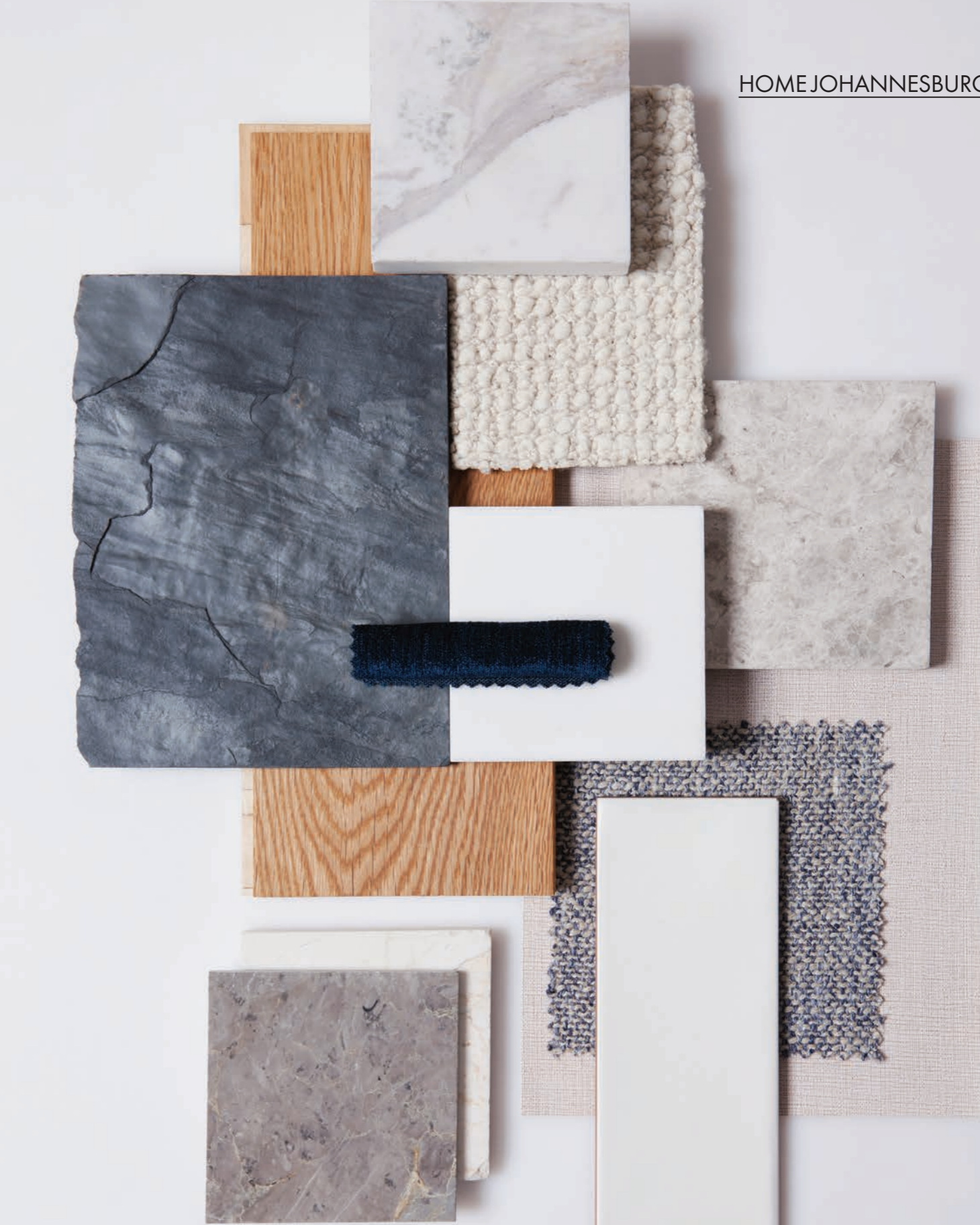
(clockwise, from top left) African blue slate tile R160/m 2 , Tile Africa; European FSC oak herringbone flooring in Natural Diamond Oil from the Legno Living collection R730/m 2 , Oggie Flooring; Volakas Kyknos polished marble slab POA, The Tile Gallery; Cobble Ridge air carpet in Mellow Ramie from the Lifestyle collection R400/m 2 , Belgotex Floors; Silver Shadow polished tile R1 264/m 2 , WOMAG; Foulards wallpaper in Abaca by Élitis R3 825/roll; and Lin enchanté fabric in Illusion by Élitis R3 932/m, both St Leger & Viney; Chalk Blanco glazed ceramic wall tile R369/m 2 , Italtile; Cashmere Light polished marble slab; and Venus Grey polished marble slab, both POA, The Tile Gallery; St Moritz fabric in Fjord R1 207/m, Home Fabrics